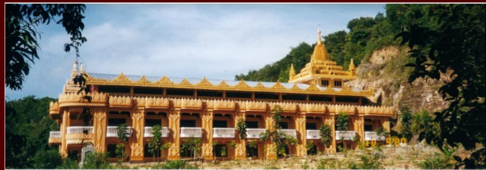
Dhammavihārī Sīmā, Cittalapabbatavihāra, Pa-Auk Tawya Buddhasāsanā Meditation Centre